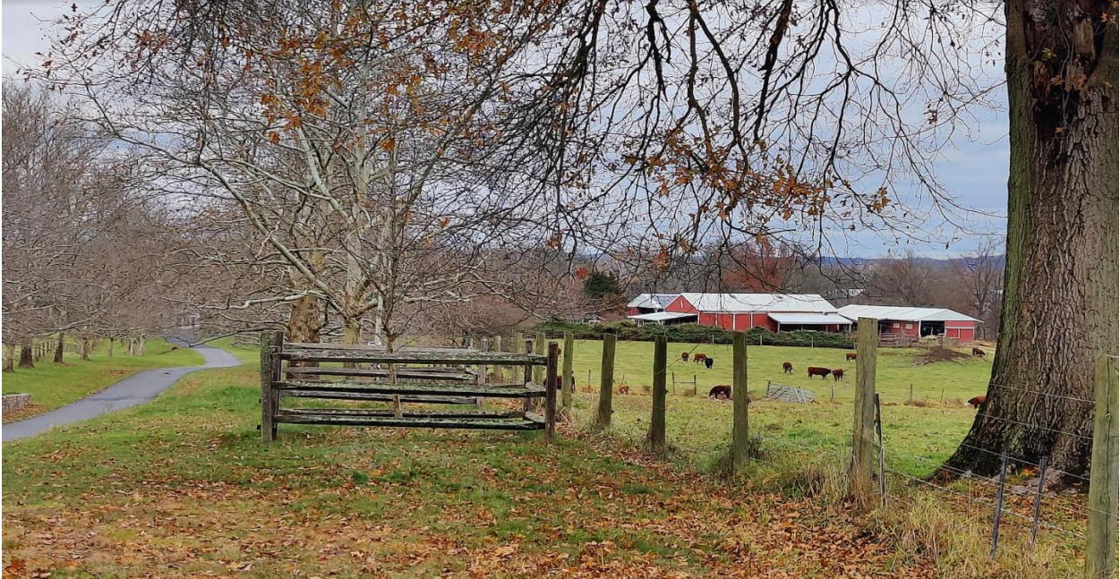
Barrettstown Joy Farm, Lamington Road – Preserved by Readington Township in 2024