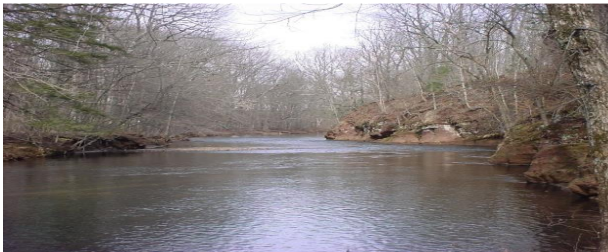
A view of the Rockaway Creek, Whitehouse Village