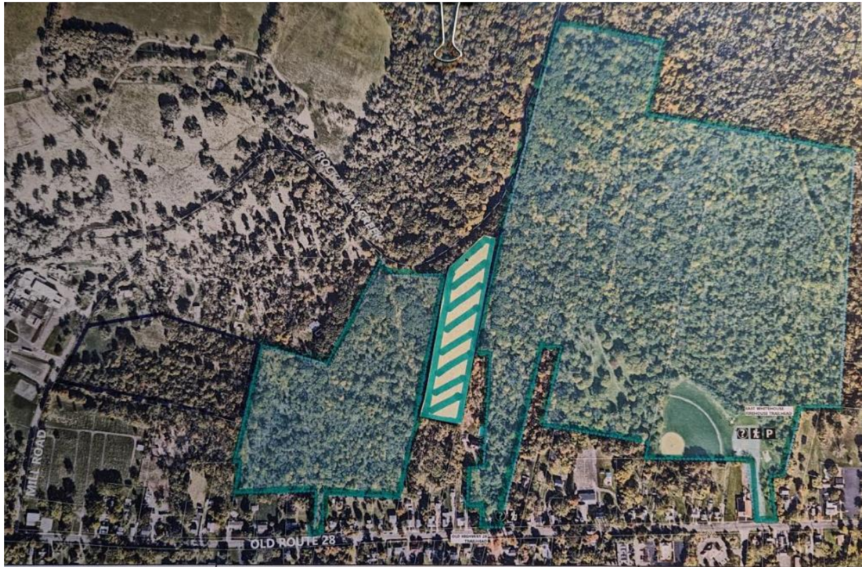
View of the 1 st Lt. Dale Haver Whitehouse Greenway, north of old Highway 28 in Whitehouse

Shaded Green parcel is the additional open space