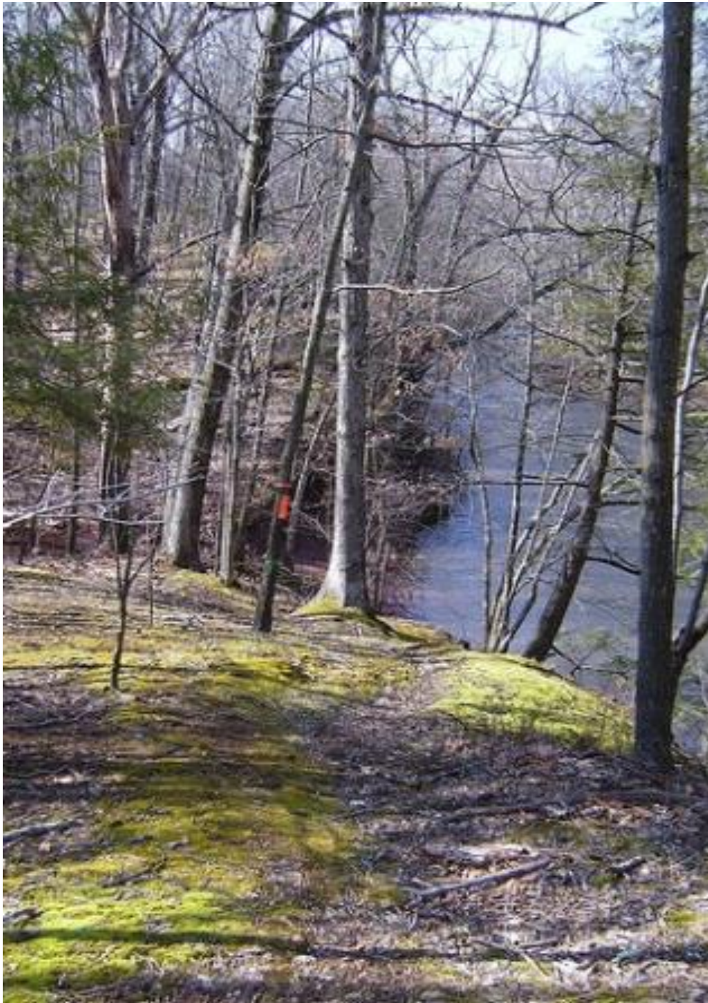
View from Trail along bluff along Rockaway Creek