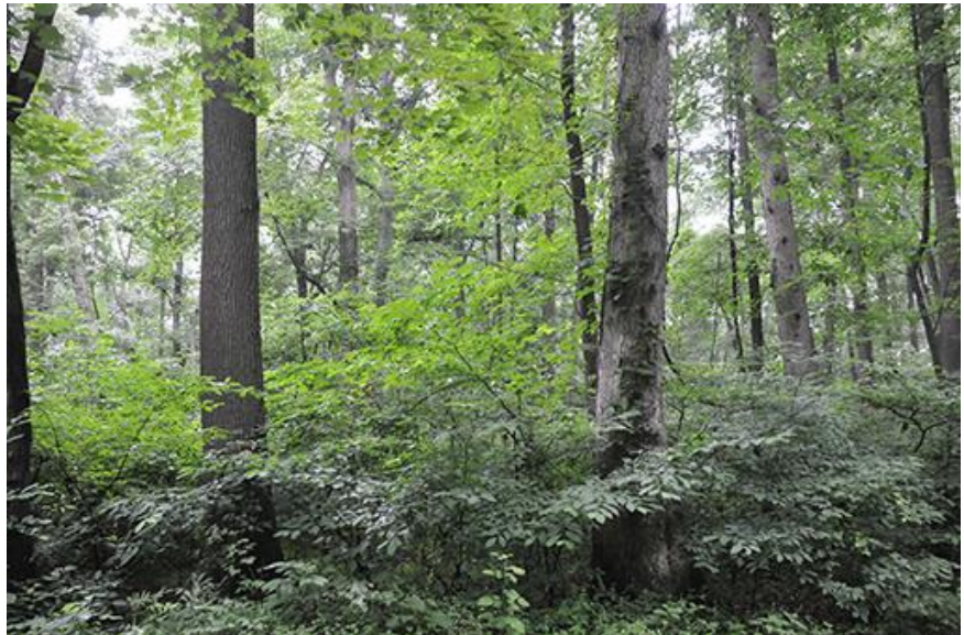
Figure 2: (Left) Over browsed forest understory; (Right) Healthy forest understory

As the steward of over 4,400 acres of open space in one of the most densely populated deer counties in the State, Readington has an obligation to implement economically responsible deer management practices. In 2019, the